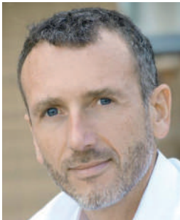
EMMANUEL FABER CHIEF EXECUTIVE OFFICER DANONE

Danone’s approach is grounded in our 2001 ‘Social Fundamental Principles,’ which are based on ILO core conventions, integrated in our operations, and embedded in supplier contracts in all countries where we are present. Moreover, we created three social innovation funds, including the Danone Ecosystem Fund, which aims to empower vulnerable members of our supply chain such as smallholder farmers and waste pickers. The Fund has implemented 70 projects worldwide totaling €143m since 2009. Its projects help workers move into the formal economy, thus mitigating the drivers of forced labour, while giving them access to fairer wages and increased opportunity.