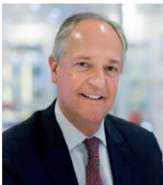
PAUL POLMAN CEO UNILEVER

“ Respecting human rights is the necessary foundation for sustainable and responsible business. We acknowledge the risk of forced labour occurring in global supply chains and know there’s more we can do to strengthen our process in this area. No one sector can successfully address these issues alone which is why we will continue to work with our business partners to create positive change. ”