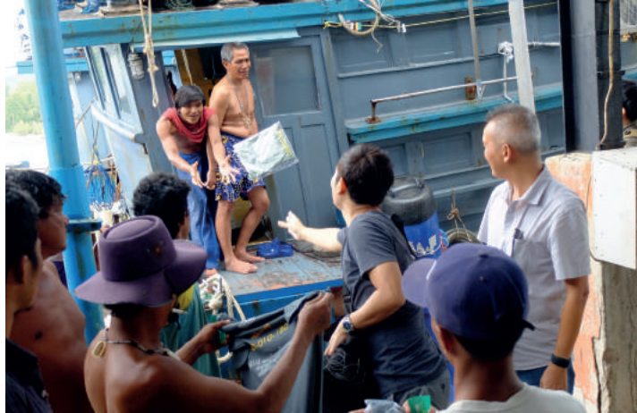
Issara outreach and worker voice channels takes place at all tiers of the supply chain, including at sea.

“ If you want to know about work, you have to talk to workers. If you want workers to share honestly, you have to earn their trust. And if you want to earn their trust, you have to empower and help build pathways to remediation. ”