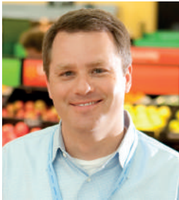
DOUG MCMILLON CHIEF EXECUTIVE OFFICER WALMART