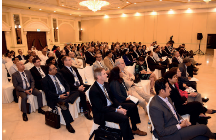
AIM-PROGRESS Dubai supplier event, 23 March 2017

“ AIM-PROGRESS – a joint initiative of 40+ member companies focusing on responsible sourcing in practice – is a perfectly suited network for the FMCG sector to support implementation of the CGF’s Priority Industry Principles ”