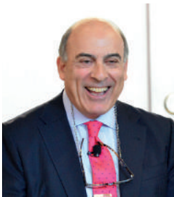
MUHTAR KENT CHAIRMAN OF THE BOARD THE COCA-COLA COMPANY

Our Supplier Guiding Principles are a part of all contractual agreements between The Coca-Cola Company and its direct and authorised suppliers and we utilise independent third parties to assess compliance with SGP. Each year, we collaborate with our bottling and supplier partners to complete approximately 2,000 human and workplace rights audits and have completed over 20,000 since our programme began.