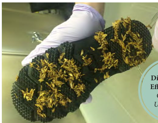
Disinfectant Effectiveness Gallardo, UC - Davis

The study showed that dust in affected poultry barns can indeed carry the virus. This finding verifies the need to minimize dust and stop transmission as quickly as possible once a flock is infected. The final results indicate that additional research is needed to find a means by which virus-laden air can be treated or filtered for barn ventilation. (Egg Industry Center)